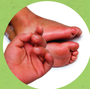
Red Palms/Soles Swollen Hands/Feet

2 or more of these Symptoms + fever for 4 – 5 days