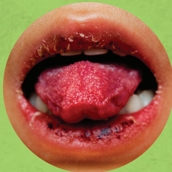
Strawberry Tongue and Red, Cracked Lips